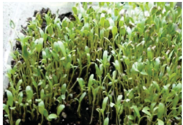
Fig 3: Methi Plants were Grown on Agricultural Soil Containing Pesticide and a Layer of Activated Charcoal

Tray 3 (Fig. 3): The soil with pesticide, after layering activated charcoal and soil above it, was estimated for lead in FP-XRF Spectrophotometer. The level of lead was detected as 12 ppm. On day 5, the soil with pesticide present below the layer of activated charcoal in tray3 was estimated for lead. It was not detected by FP-XRF spectrophotometer. On day 10, the lead was found to be absent in the soil beneath the activated charcoal. On day 15, the soil with pesticide below the layer of activated charcoal was estimated for lead and it was found to be absent. On day 20, lead was absent in the soil with pesticide layer.