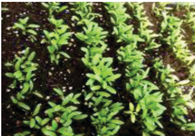
Fig. 2: Methi Plants were Grown on Agricultural Soil Treated with Pesticide.

Lead in soil with pesticide in tray 2 was estimated on day 15 as 16 ppm, lead was detected in higher amount in this case. On day 20, the soil mixed with pesticide was estimated for lead and was found to be drastically increased to 18 ppm.