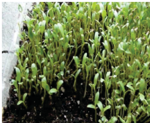
Fig. 1: Methi Plants Grown on Agricultural Soil.

Tray 1 (Fig. 1): The soil in control tray was estimated for lead by using FP-XRF and found to be not detected (<11 ppm). The soil in control tray was estimated for lead in FP-XRF spectrophotometer on day 5. The result indicated the absence of lead. The soil of day 10, in Tray 1 was estimated for lead. The lead content was found to be increased to 14 ppm. The soil in control tray on day 15 was not found to be containing lead. Lead in control tray of day 20 was estimated in the FP-XRF spectrophotometer to be 13 ppm.